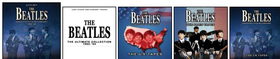
Abbildungen von links: Box, und die vier CDs mit zusätzlichen "card sleeve"-Covern

Presstext: This stunning collection brings together rare and previously unreleased versions of the BEATLES classics. We commence with the ten of the lost tracks from the famous Decca audition which are finally released. Also included are the live broadcasts from the BBC and alternate versions from the ABBEY ROAD STUDIOS recordings. The anthology ends with the complete versions of the ATV broadcasts from Blackpool including the first ever performance of Yesterday.